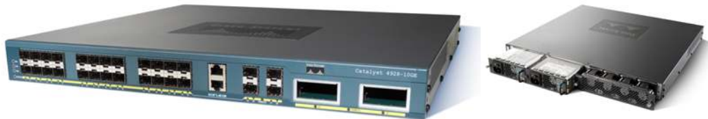
Figure 1. Cisco Catalyst 4928 10 Gigabit Ethernet Switch with Hot-Swappable Fan Tray and Power Supplies

The Cisco Catalyst 4928 10 Gigabit Ethernet Switch offers 28 wire-speed 1000BASE-X Small Form-Factor pluggable (SFP) ports and 2 wire-speed 10 Gigabit Ethernet (X2 optics) ports. Exceptional reliability and serviceability are delivered with optional internal AC or DC 1 + 1 hot-swappable power supplies and a hot-swappable fan tray with redundant fans (Figure 1).